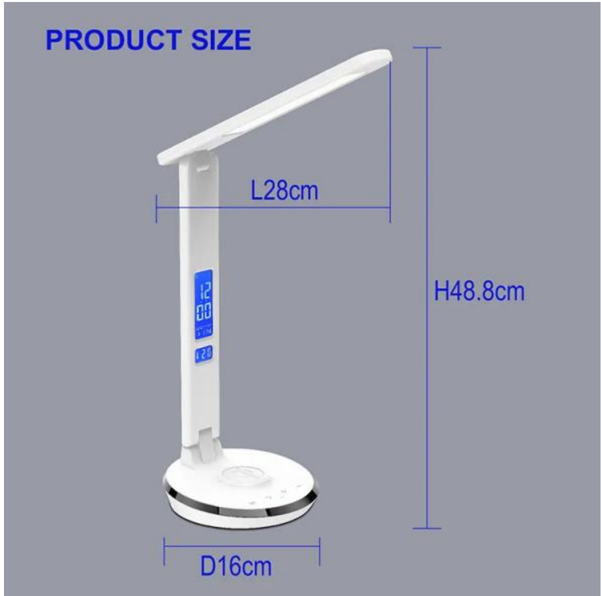
Dimensions of our woodled wireless charge led desk lamp